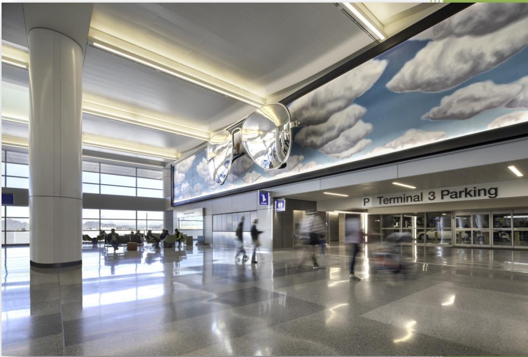
Artist: Donald Lipski