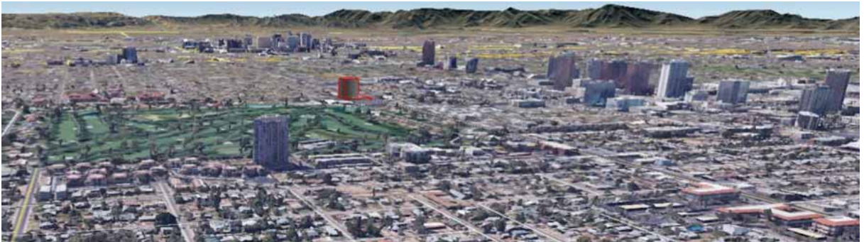
Looking south, 1960s era zoned Crystal Point in foreground, proposed Tower in red.

The City Staff Report confirms the basis for the outrage of neighbors to 175 feet over \frac{1}{2} mile away from Central Avenue , beyond the MidTown TOD , and outside the infill height incentive district . The City Staff Report recommends denial of the rezoning because it: