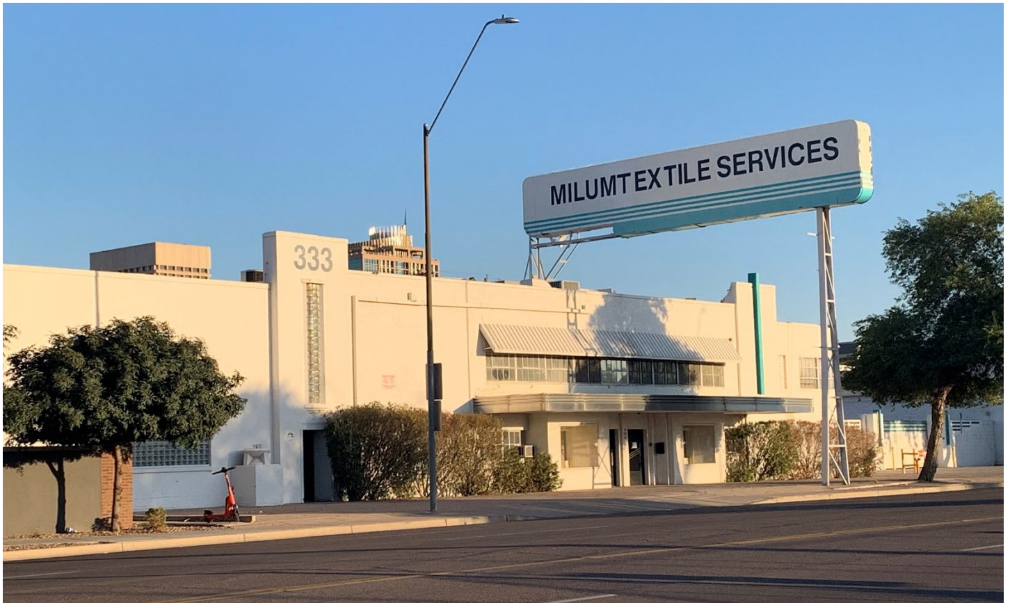
View from 7 th Avenue, 10/20/2023