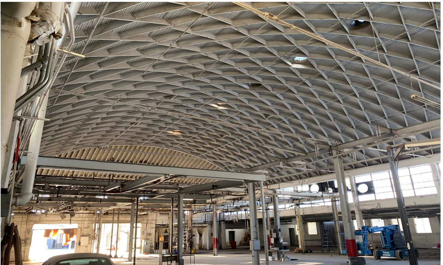
Interior view, 10/20/2023