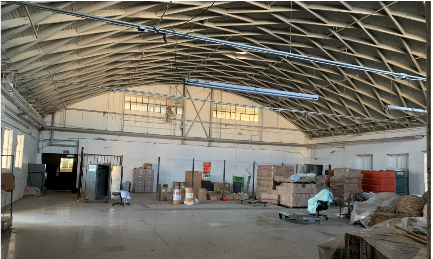
Interior view, 10/20/2023