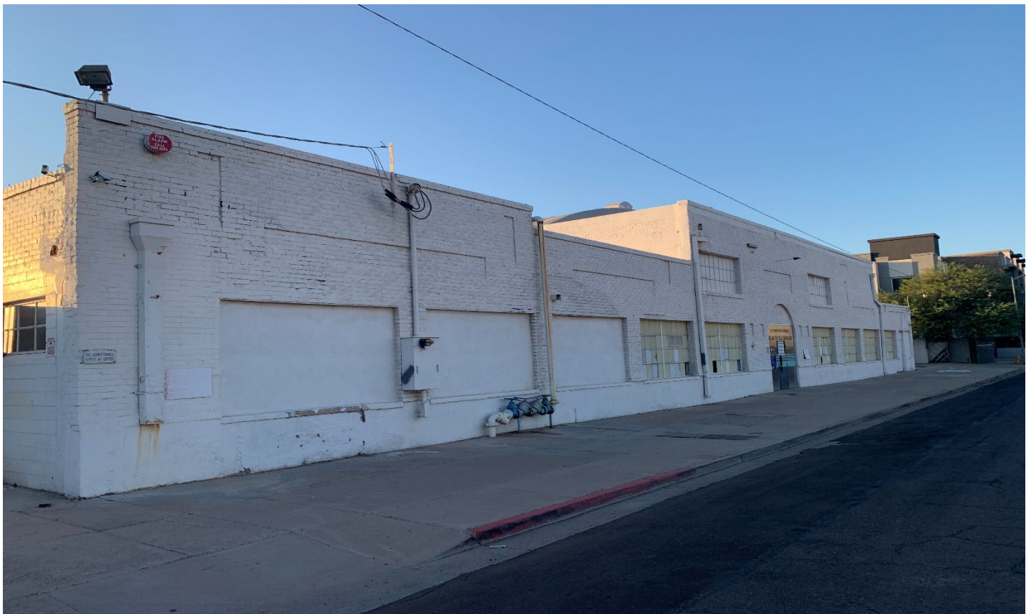
View from 6 th Avenue, 10/20/2023