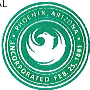
City Clerk SEAL