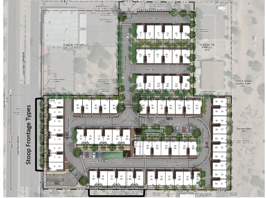
Stoop Frontage Types

Conceptual Site Plan from February 1, 2022 with stoop frontage types annotated.