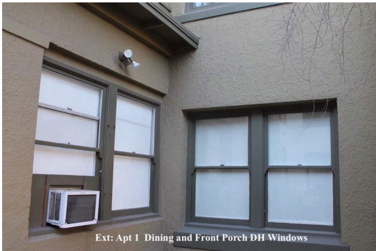
Ext: Apt 1 Dining and Front Porch DH Windows