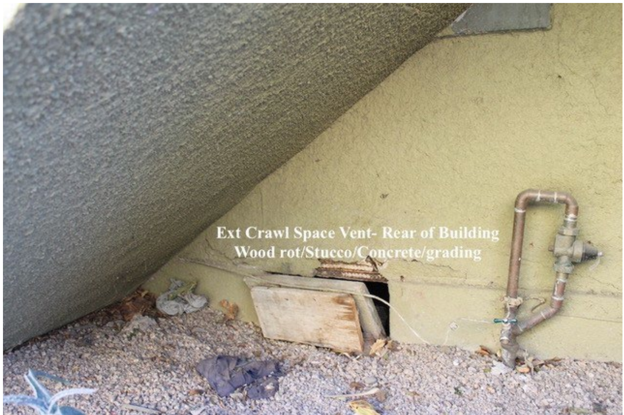
Ext Crawl Space Vent- Rear of Building Wood rot/Stucco/Concrete/grading